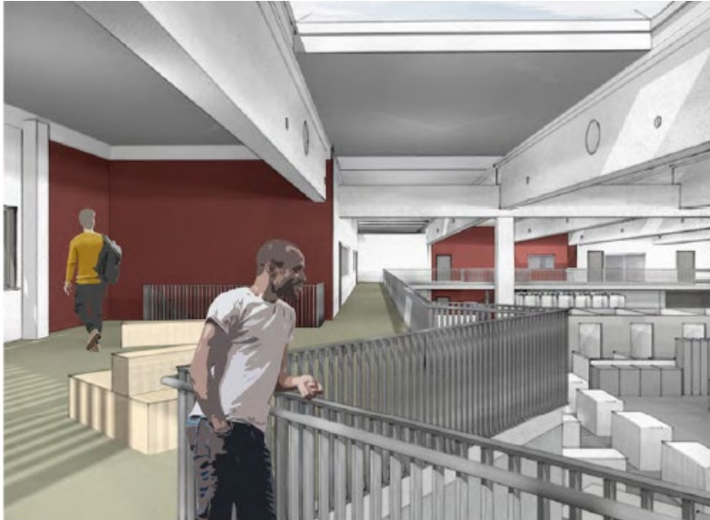
Figure: The new state-of-the-art apprenticeship center at the Willstätt site will have a range of training rooms and ultra-modern learning workstations