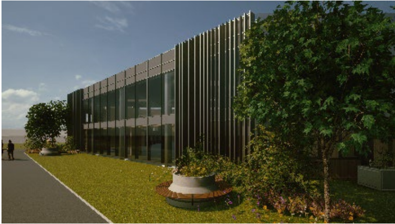
Figure: The Koehler Group is investing roughly 73 million euros in the new site in Willstätt.